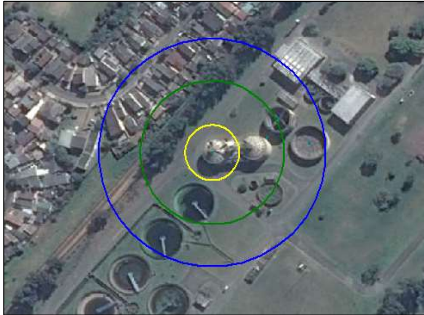
FIGURE 2 – Sludge Drying Room Internal Explosion